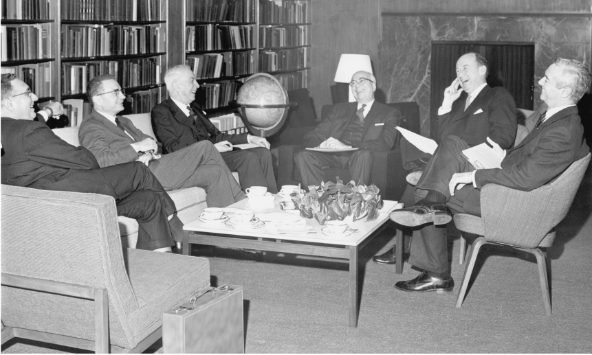
FIGURE 2. New York, February 19, 1961. Seated left to right, participating guests who appeared on the first of The Great Challenge symposia of 1961: Professor Henry A. Kissinger, Director of the Harvard International Seminar; Dr. Paul A. Samuelson, Professor of Economics at MIT and President of the American Economic Association; Professor Arnold J. Toynbee, world historian; Admiral Lewis L. Strauss, former Chairman of the Atomic Energy Commission and former Secretary of Commerce; Adlai E. Stevenson, U.S. Ambassador to the United Nations; and Howard K. Smith, CBS news correspondent in Washington, moderator of the program. The topic: “The World Strategy of the United States as a Great Power.”

interest rate in a multiple regression testing whether M drives P , Q/V , or Q in some systematic manner congenial to making a constant rate of growth of money supply, M_1 , an optimal guide for policy, then in varied samples the interest rate alone works better without M than M works alone or without the interest rate.