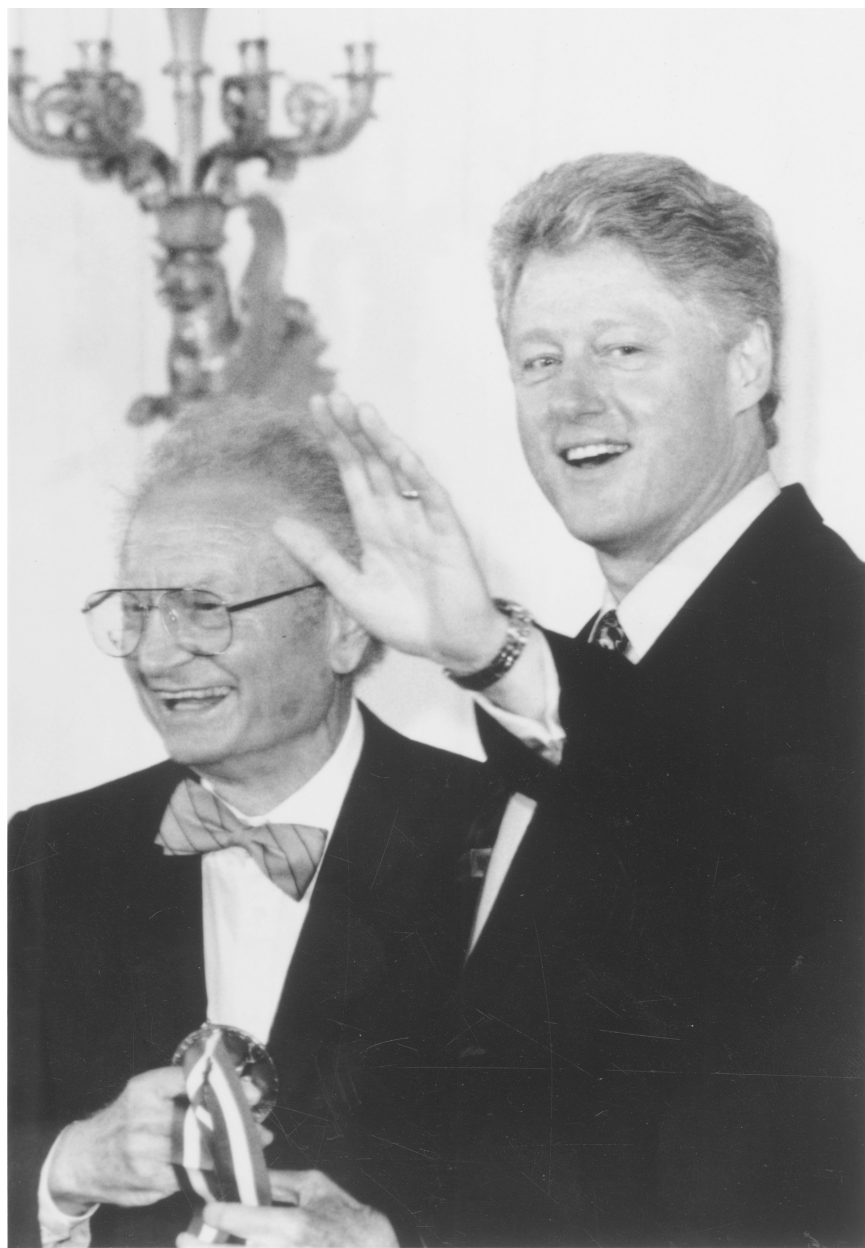
FIGURE 5. Paul Samuelson with Bill Clinton in White House.