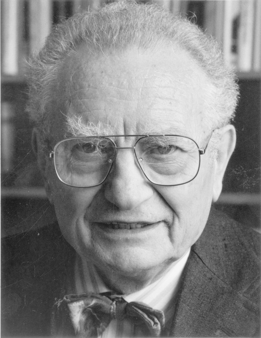
FIGURE 1. Paul A. Samuelson.

defense, Schumpeter turned to Leontief and asked, “Well, Wassily, have we passed?” Paul Samuelson moved on to M.I.T. where he built one of the century’s most powerful economics departments around himself. He was soon joined by R.M. Solow, who was to become Samuelson’s sometime co-writer and partner-in-crime.